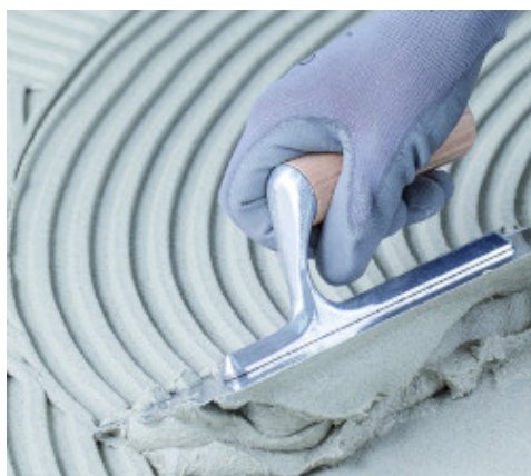
Spreading Adesilex P9 white