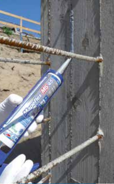
Extruding Mapeflex MS45 prior to applying Idrostop Soft in second pours