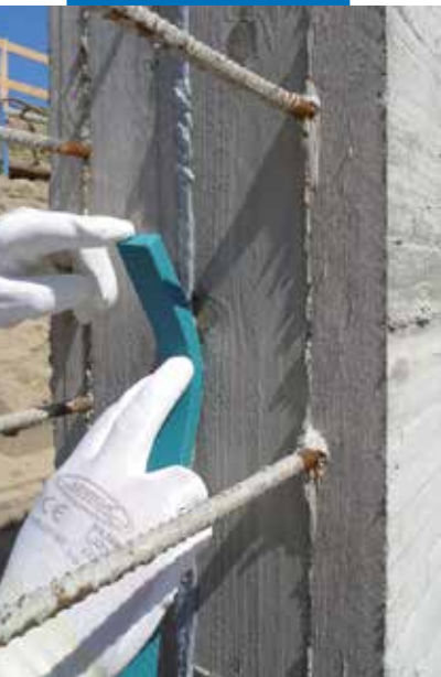
Applying Idrostop Soft on vertical surfaces