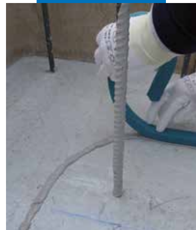
Applying Idrostop Soft on horizontal surfaces

All relevant references for the product are available upon request and from www.mapei.com